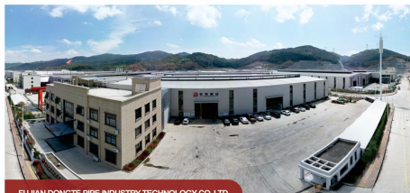
FUJIAN DONGTE PIPE INDUSTRY TECHNOLOGY CO.,LTD

福建东特管业科技有限公司，作为一家位于中国福建省宁德市周宁县的高新技术企业，专注于不锈钢无缝管的研发、生产与销售。公司不仅技术先进，产能强大，更在质量管理体系和行业认证方面表现卓越。东特管业年产8000余吨不锈钢管材，注册资金2000万元人民币，实缴资本一亿元人民币左右，厂房占地面积达到30亩，公司汇集了80名员工，其中包括2位高级工程师和15位本科及以上学历的专业人士，形成了一支技术精湛的团队。